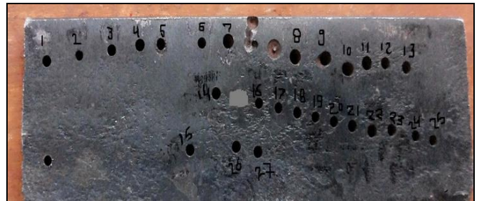
Fig 1: Specimen after EDM drilling

Weren't' is the sheet thickness and d_{ent} is the diameter of hole at entrance. The d_{min} and d_{max} are the values of minimum and maximum diameters respectively, out of the four readings (i.e., d_1 to d_4 ) for each hole.