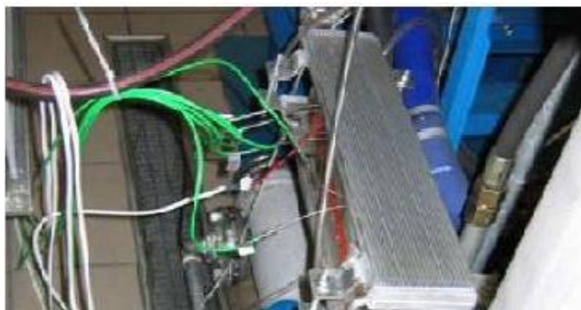
Fig 4: Thermoelectric generator mounted on exhaust system.

TEGs are made from thermoelectric modules which are solid-state integrated circuits that employ three established thermoelectric effects known as the Peltier, Seebeck and Thomson effects. Their construction consists of pairs of p-type and n-type semiconductor materials forming a thermocouple. These thermocouples are then connected electrically forming an array of multiple thermocouples called as thermopile. They are then sandwiched between two thin ceramic wafers. When heat and cold are applied this device then generates electricity.