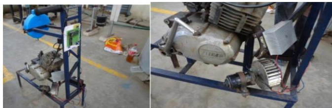
Fig 3: Specification of the two stroke petrol engine