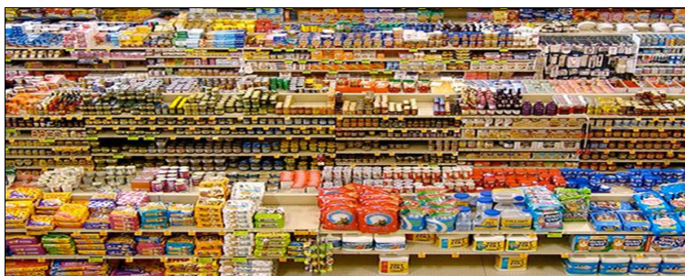
Fig 1: Food Items

The Some of the major contributors for food processing industry are FMCG, Patanjali and the products are fruits, milk and spices and food grains.