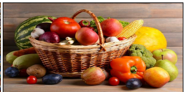
Fig 2: Fruits and Food Grains